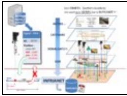
InfraNet: Different levels of detail